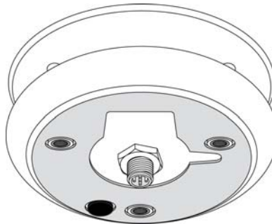
Figure 2 – WSO100 Interface Connector

The Maretron WSO100 provides a connection to an NMEA 2000 ® interface through a connector that can be found on the bottom of the device (see Figure 2).